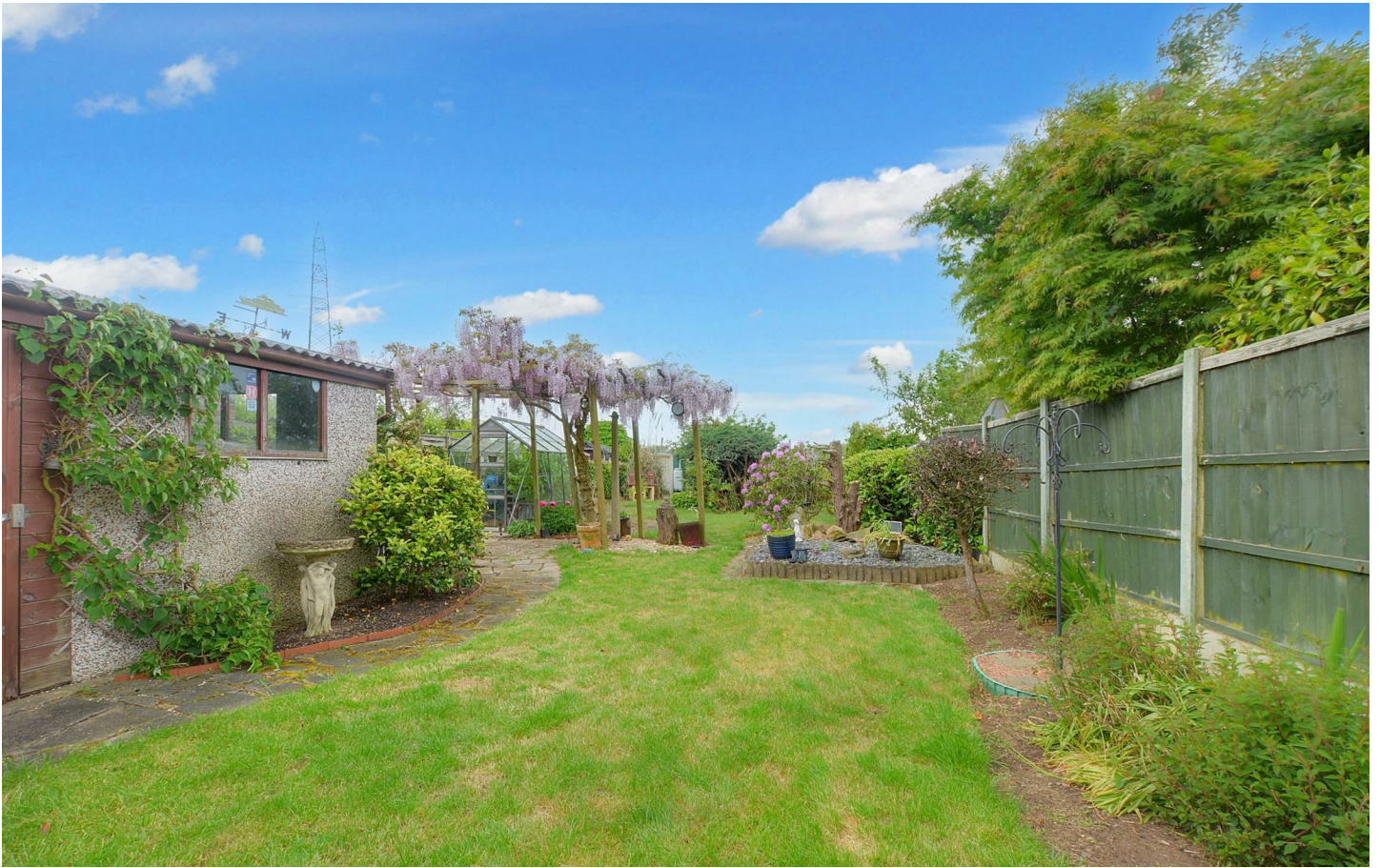
A three bedroom bay fronted semi-detached house with a garage.

Situated in this sought-after and convenient residential location, within easy reach of a variety of local shops and amenities including; schools, transport links, Beeston Marina, Beeston Canal and Attenborough Nature Reserve, this fantastic property is considered a rare and ideal opportunity for a range of potential purchasers including; first time buyers, young professionals and families.